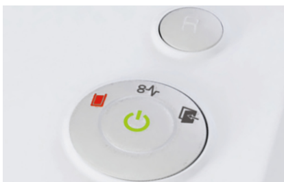
The full bin is indicated via the