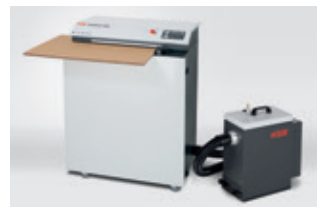
HSM DE 1-8 dust extractor for HSM ProfiPack P425 incl. adapter set for dust extractor