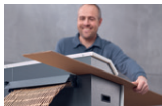
Cutting and bolstering in one work process