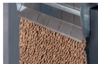
Creation of compressed packaging material with a closed compression flap (HSM ProfiPack P425).