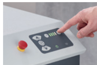
Feed-in speed adjustable (single-phase model)