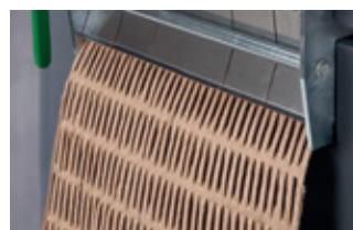
Creation of padding mats (HSM ProfiPack P425).