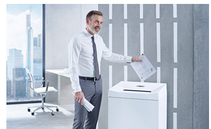
The operation is very easy: the