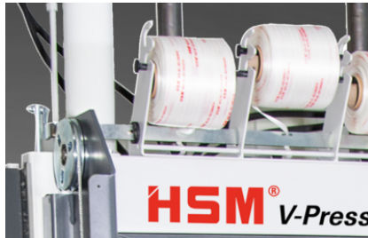
Manual bale strapping with continuous polyester tape