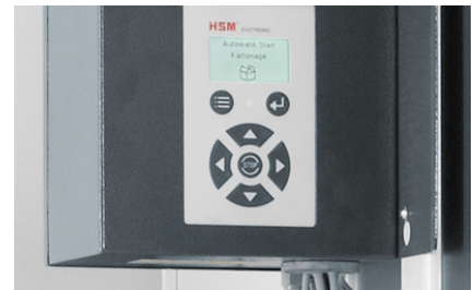
Modern microprocessor controller with membrane keypad and text display