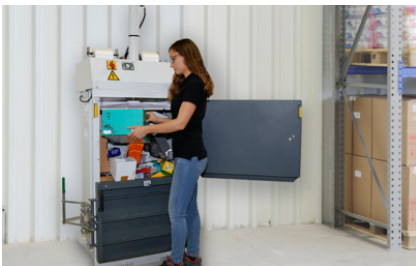
To fill the press, the upper half of the doors is swung to the right