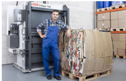
Optimised bale dimensions and bale weights for efficient storage, transport and direct commercialisation