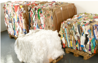
Suitable for cardboard as well as film