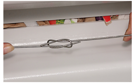
Manual 4-fold strapping with Quick-link wire