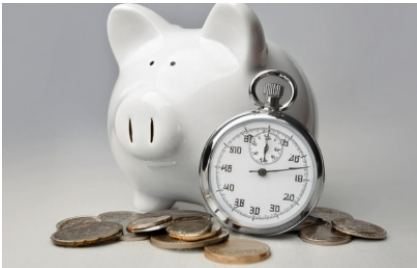
Saves up to 1.5 h per bale compared to other vertical baling presses with automatic loading. Each cart is emptied within 12 seconds