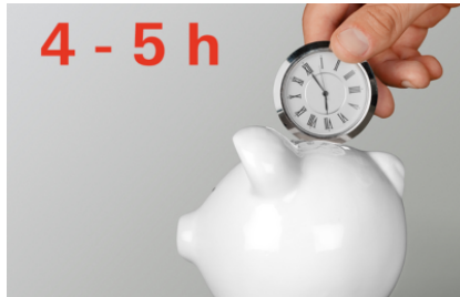
Saves up to 5.0 h per bale compared to other vertical baling presses with manual loading