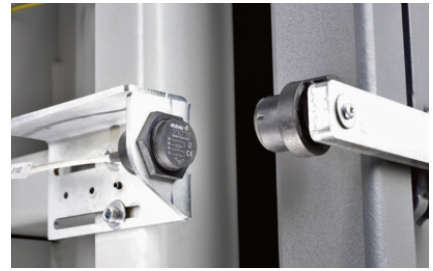
Automatic start of the pressing process after closing the door