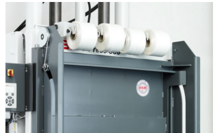
Strapping with wire - optional tape station available for strapping with polyester tape or wire according to requirements