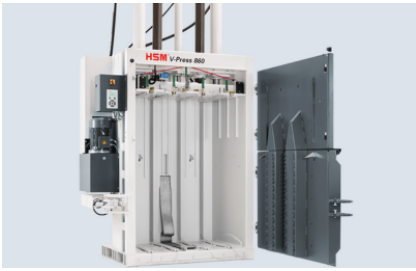
Special profiles in the bale ejection door in the filling hatch and in the press ram form recesses in the bales