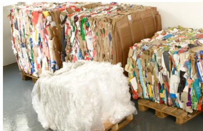
Suitable for cardboard as well as film