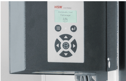
Convenient membrane keypad with text display, which shows the current status of the machine