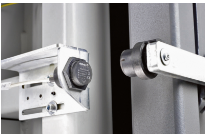
Automatic start of the pressing process after closing the door