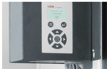
Convenient membrane keypad with text display, which shows the current status of the machine