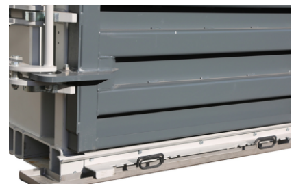
Stainless steel tray for manual draining