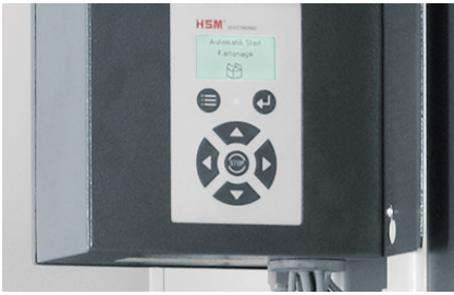
Convenient membrane keypad with text display, which shows the current status of the machine