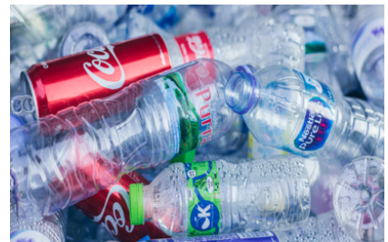
Compacts PET and beverage cans