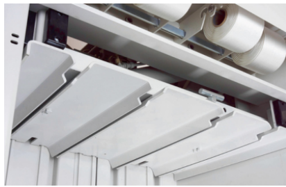
Massive press ram and extremely robust press plate guidance