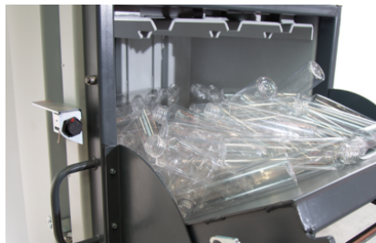
Simple loading thanks to the filling flap at a convenient working height.