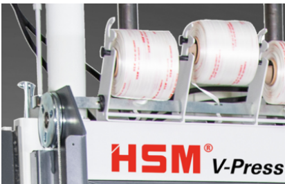
Manual bale strapping with continuous polyester tape