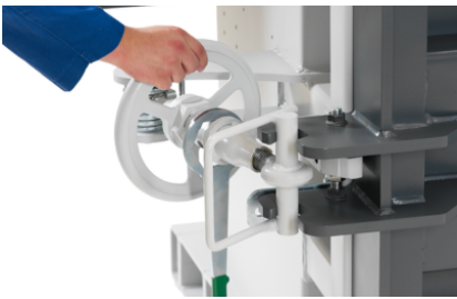
Hand wheel door lock - Easy to handle thanks to counter-rotating thread for quick opening and closing