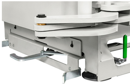
Pallet locking mechanism for safe bale removal