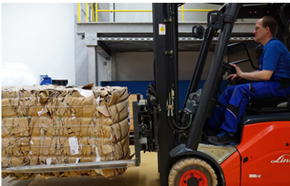
High specific pressing power provides a high compaction of the material and consequently an optimum HGV load