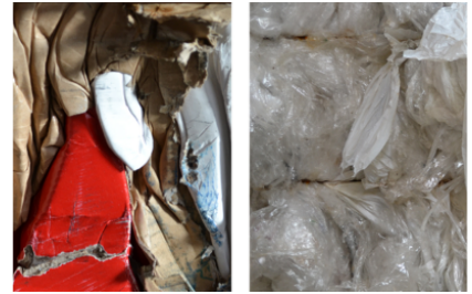
Particularly suitable for compression of cardboard and plastic film