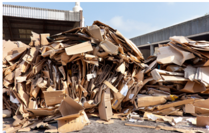
Versatile solution for materials up to approx. 60 kg /m 3 bulk weight