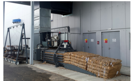
Suitable for almost all requirements. Contact us if you have other materials or applications. We will find you a suitable solution.