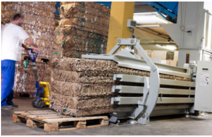
Integration into automated industrial production processes