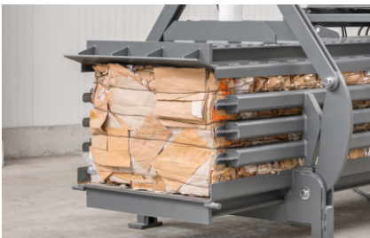
Suitable for compressing paper, cardboard, shredded material and plastic film