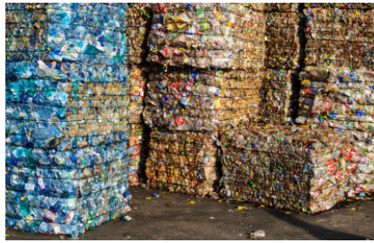
High compression and bale weights