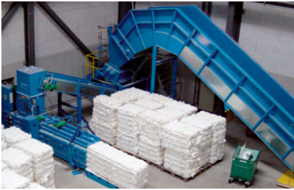
Integration into automated industrial production processes