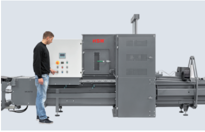
Operating side can be selected