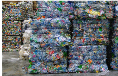
Compresses paper, cardboard, plastic film and PET bottles