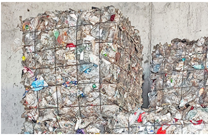
Available as an option with cross strapping