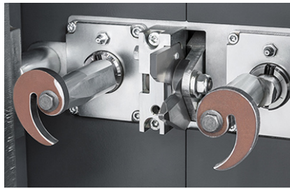
Solid steel construction with extremely wear-resistant, replaceable steel