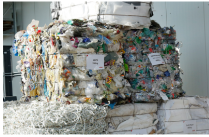
Suitable for cardboard, plastic film and compressing DSD goods, UBC as well as PET bottles (other materials on request)