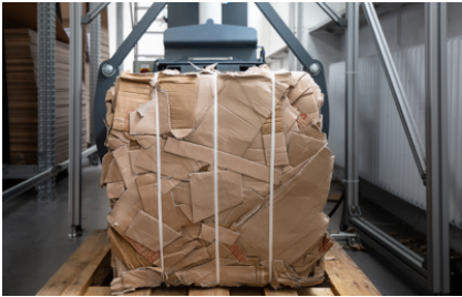
Available as an option with manual strapping