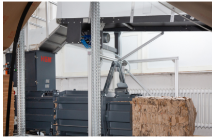
Integration into automated industrial production processes