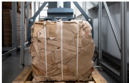
Available as an option with manual strapping