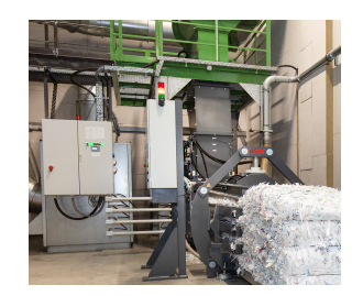
Suitable for continuous loading with conveyor belt, air feeding or similar