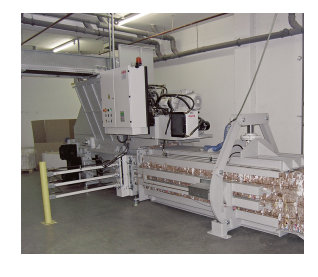
Integration into automated industrial production processes