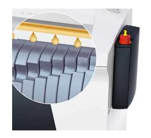
For a consistently high cutting performance, this low maintenance document shredder has an external automatic oiler as an option.