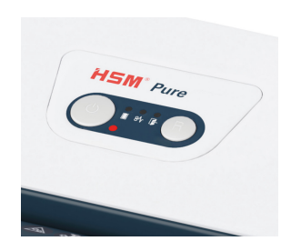
The full bin is indicated via the display and the machine switches off automatically.