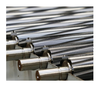
The induction-hardened, solid steel cutting rollers with a lifetime warranty can easily cope with staples and paper clips and guarantee durability.