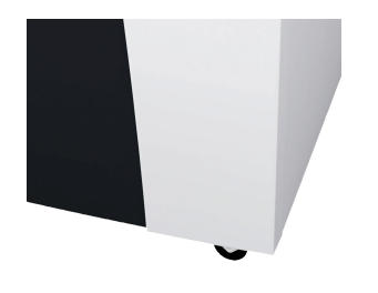
For convenience, there are castors on the document shredder so it is easy to move around.

The induction-hardened, solid steel cutting rollers guarantee durability.